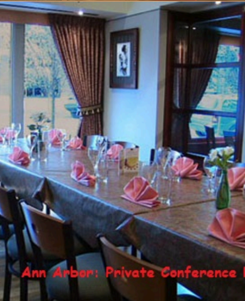
Ann Arbor: Private Conference