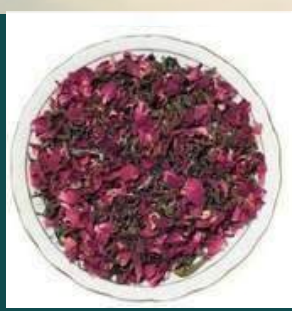
ROSE PETAL GREEN TEA