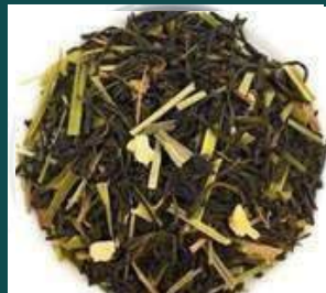
LEMONGRASS GREEN TEA