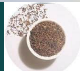
TULSI GREEN TEA 5320/- INR, 65.68$ PER KG