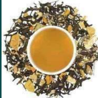
TURMERIC GINGER TEA