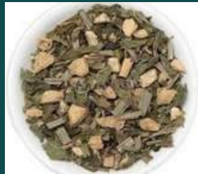
GINGER MINT GREEN TEA