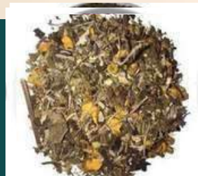
BLOOD PRESSURE SUPPORT TEA