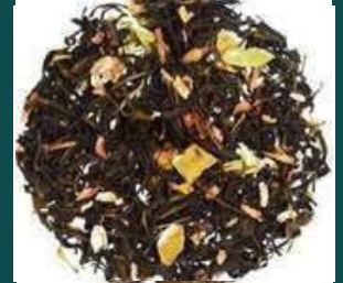
JASMINE ZEST GREEN TEA