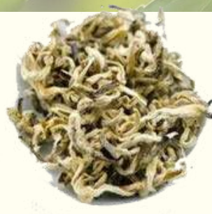
ORGANIC WHITE LEAF TEA

STARTING PRICE - 800/- per kg (9.87$per kg)