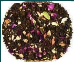
KASHMIRI KAHAWA TEA