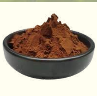
100% SOLUBLE TEA

Instant tea is a blend that can be mixed with water to make a drink. It's made by spray-drying tea leaves, milk, and other tea ingredients to extract the solids.