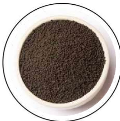
BOPSM & BOP