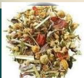
CHAMOMILE CITRON TEA