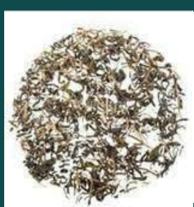
ROSEMARY GREEN TEA 2100/- INR, 25.92$ PER KG