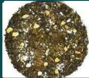
HONEY LEMON GINSENG