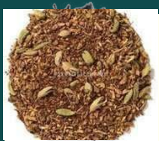
SPICE HERBAL TEA