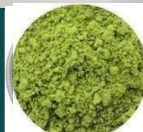
MORINGA MATCHA TEA 2100/- INR, 25.92$ PER KG