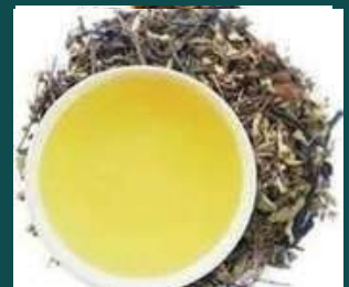
MINT BLAST TEA