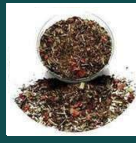
DIGESTIVE HERBAL GREEN TEA 2240/- INR, 27.65$ PER KG

“Consistent Quality And Competitive Pricing Year-Round From The Estate.”