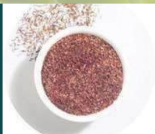
SOUTH AFRICAN ROOIBOS 3080/- INR, 38.02$ PER KG

Herbal tea is an infusion of any edible plant, available in numerous varieties. It can be made using ingredients like tree bark, flowers, leaves, roots, spices, seeds, and fruit.