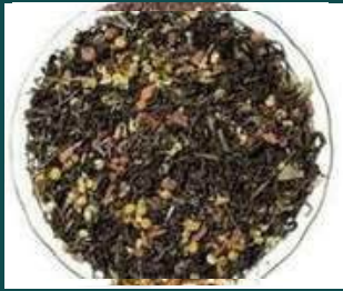
CHAMOMILE MINT TEA

Most hot beverages with herbal or fruit infusions are called "tea," though technically, they are tisanes. Many are surprised to learn that all true teas come from the Camellia sinensis plant.