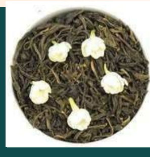
JASMINE GREEN TEA