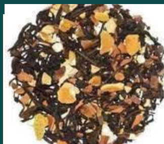
ORANGE CINNAMON TEA