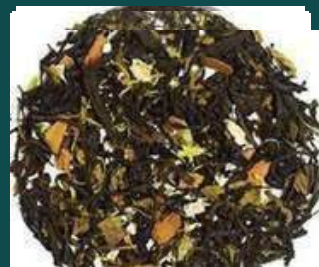
MASALA MINT GREEN TEA