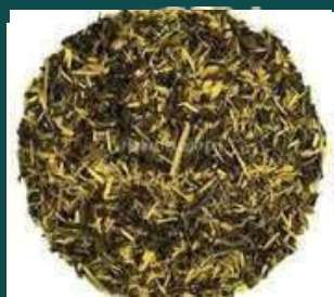
MULETHI ZING TEA