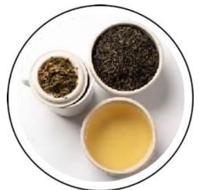
Flavour & Organic Tea

“Consistent quality and competitive pricing year-round from the estate.”