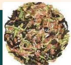
ARJUN TEA GOOD HEART