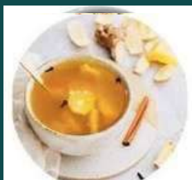
AYURVEDA FASTNG TEA