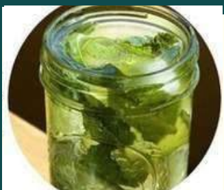
MOJITO MINT GREEN ICED TEA