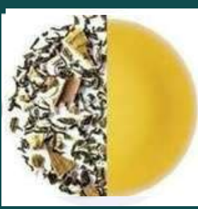
SKIN GLOW TEA 2660 INR, 32.83$ PER KG