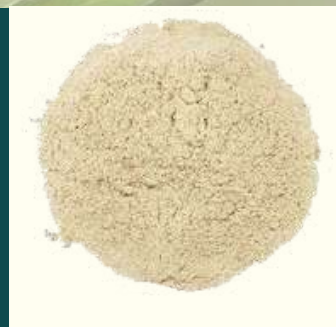
TEA PREMIX (FLAVOURS & NON FLAVOURS)