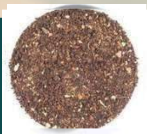
CHICORY MASALA TEA

Herbal tea is an infusion of any edible plant, available in numerous varieties. It can be made using ingredients like tree bark, flowers, leaves, roots, spices, seeds, and fruit.