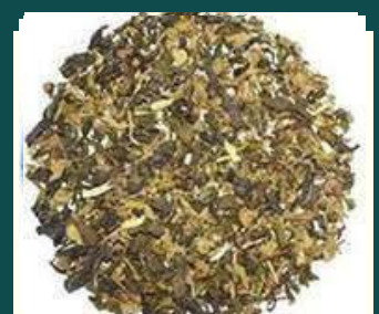
SOOTHING TULSI GREEN TEA