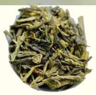
ORGANIC GREEN LEAF TEA

STARTING PRICE - 3200/- per kg (39.51$per kg)