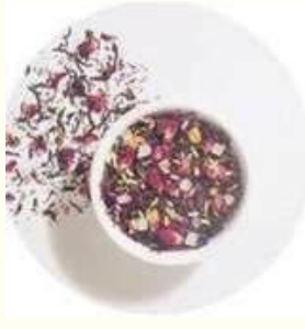
PAAN ROSE TEA

Most hot beverages with herbal or fruit infusions are called "tea," though technically, they are tisanes. Many are surprised to learn that all true teas come from the Camellia sinensis plant.