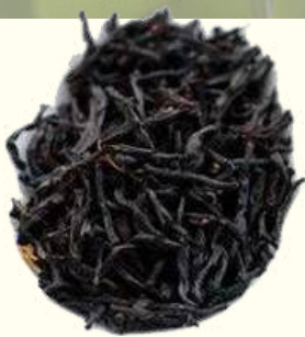
ORGANIC BLACK LEAF TEA

STARTING PRICE - 800/- per kg (9.87$per kg)