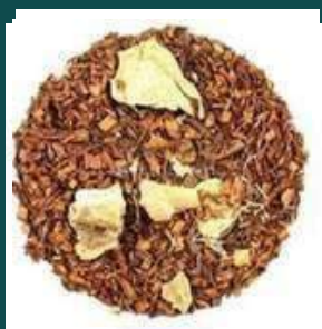
ROOIBOS MASALA TEA 5320/- INR, 65.68$ PER KG