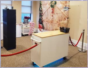
The Mojo Open Or Closed Booth