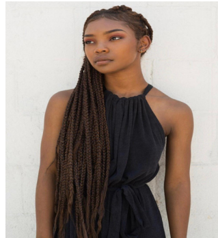
Health-Based User Experience (UX)