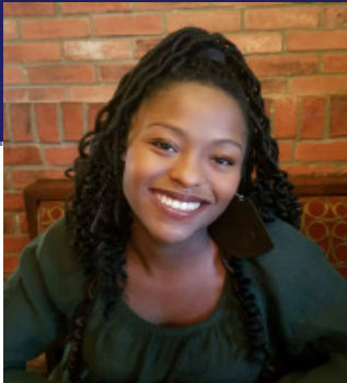
Juris Doctor Law