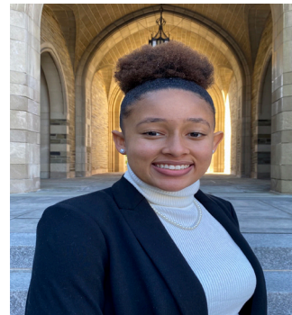
Doctor of Medicine Degree

Education is the most powerful weapon which you can use to change the world Nelson Mandela