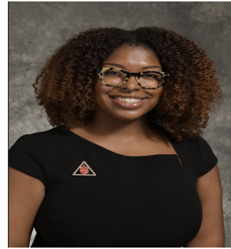
Doctor of Dental Surgery