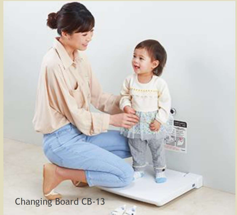
Changing Board CB-13