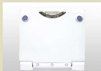
Rear view - with rubber foot