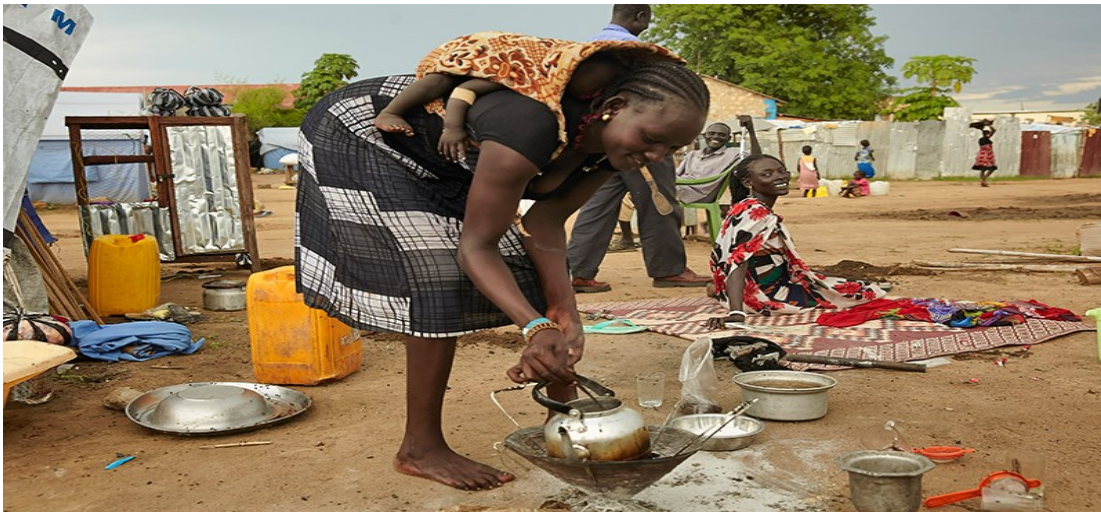
Smiling Sudanese Women living in constant fear and hardship.

"The Mission of First United Methodist Church of Roseville is to lovingly invite, nurture, teach and send out disciples of Jesus Christ."