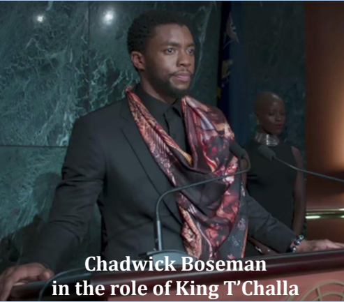
Chadwick Boseman in the role of King T’Challa