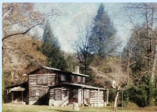
Main Cabin of the Cumberland Mountain Mission, Stoney Creek area of Fort Blackmore, VA