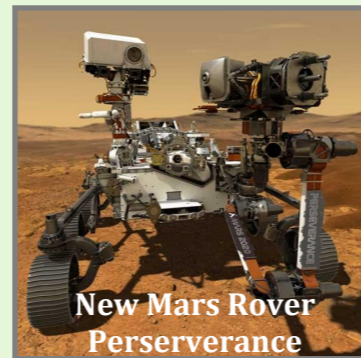
New Mars Rover Perseverance