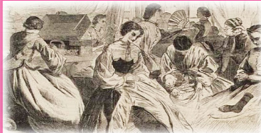
Winslow Homer's drawing of a Ladies' Aid Society in Harper's Weekly, 1862