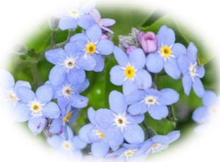
Forget Me Nots