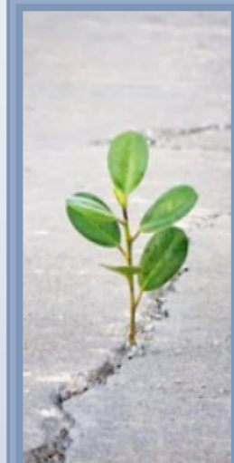
Contributed by Cathe Moody Idea & words from theearthtribe

Still, you must never underestimate the power of planting a seed.