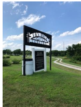
Fry Hill Cemetery