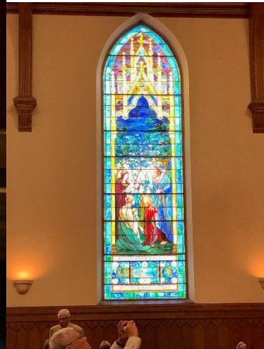
Immanuel Presbyterian Church