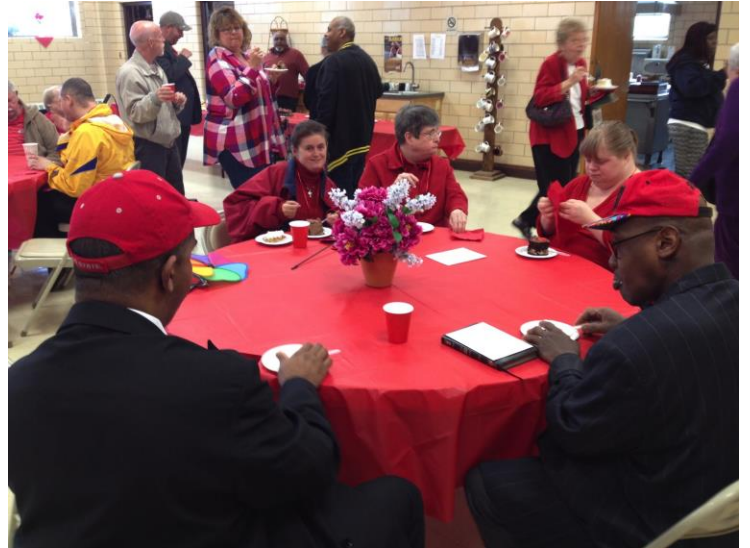
Faith Class Members