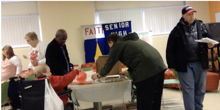
Christmas Party 2019