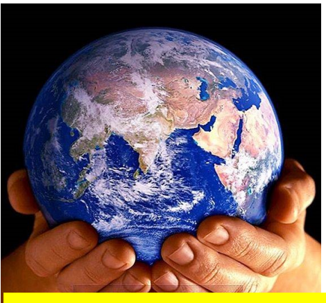
GLOBAL PROBLEMS - 2021