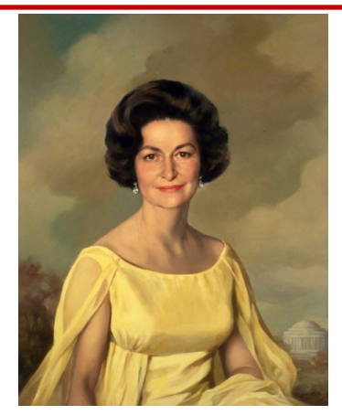
(2) (Lady Bird) President