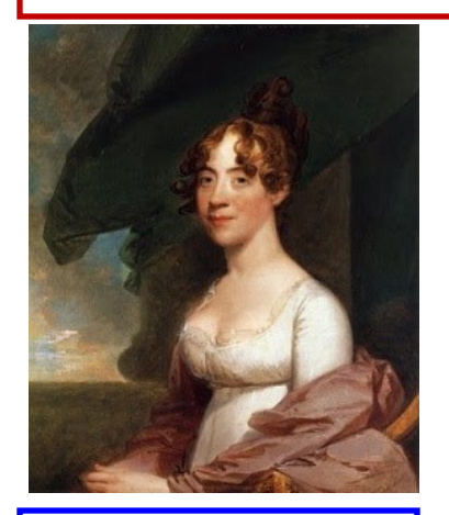
(1) (Dolley) President _____

It was once said, "Behind every great man, is a great woman." Though that wording is now deemed to be antiquated, sexist, and gender biased, it does seem to be the history of our US Presidency. This month's quiz, looks for you to identify these US President by the name and picture of his First Lady. Good luck! (We'll start 2022, with an easy quiz!)