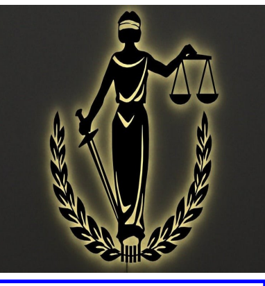
LADY JUSTICE A most patient woman