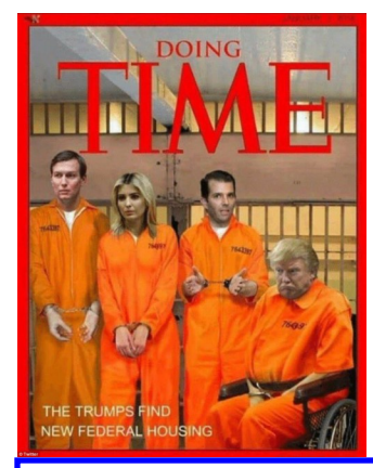
The "links" that bind our family together!

What are your thoughts? Write me letter, or even send a short Email or text and give us your analysis on where you think it all goes, or where you'd like to see it head and end up. I'd LOVE to see 10 or 20 of you respond and we can put some of them in the next newsletter.