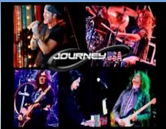
Journey USA July 9th