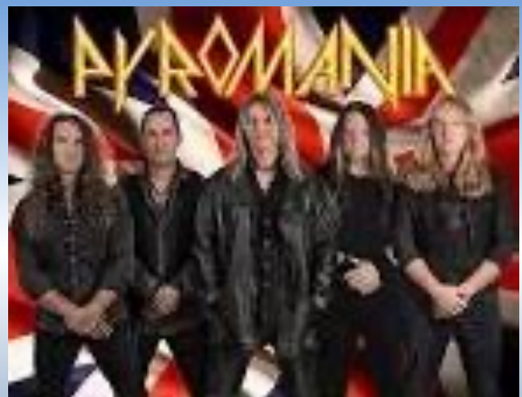
Pyromania Def Leopard Tribute Band July 30th