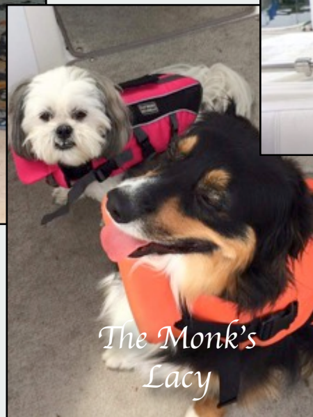
The Monk's Lacy