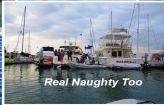
Real Naughty Too