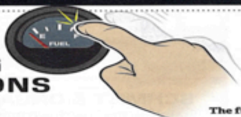
The fuel gauge on E