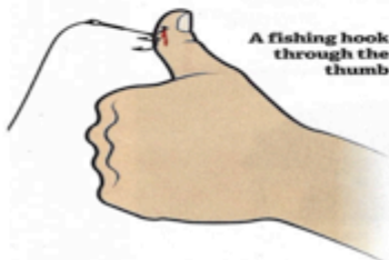
A fishing hook through the thumb