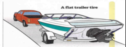
A flat trailer tire