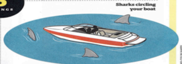
Sharks circling your boat