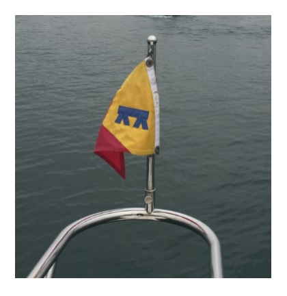
Beautiful Picture- Close to my heart

Thank You Cruise Captains for a very fun evening.