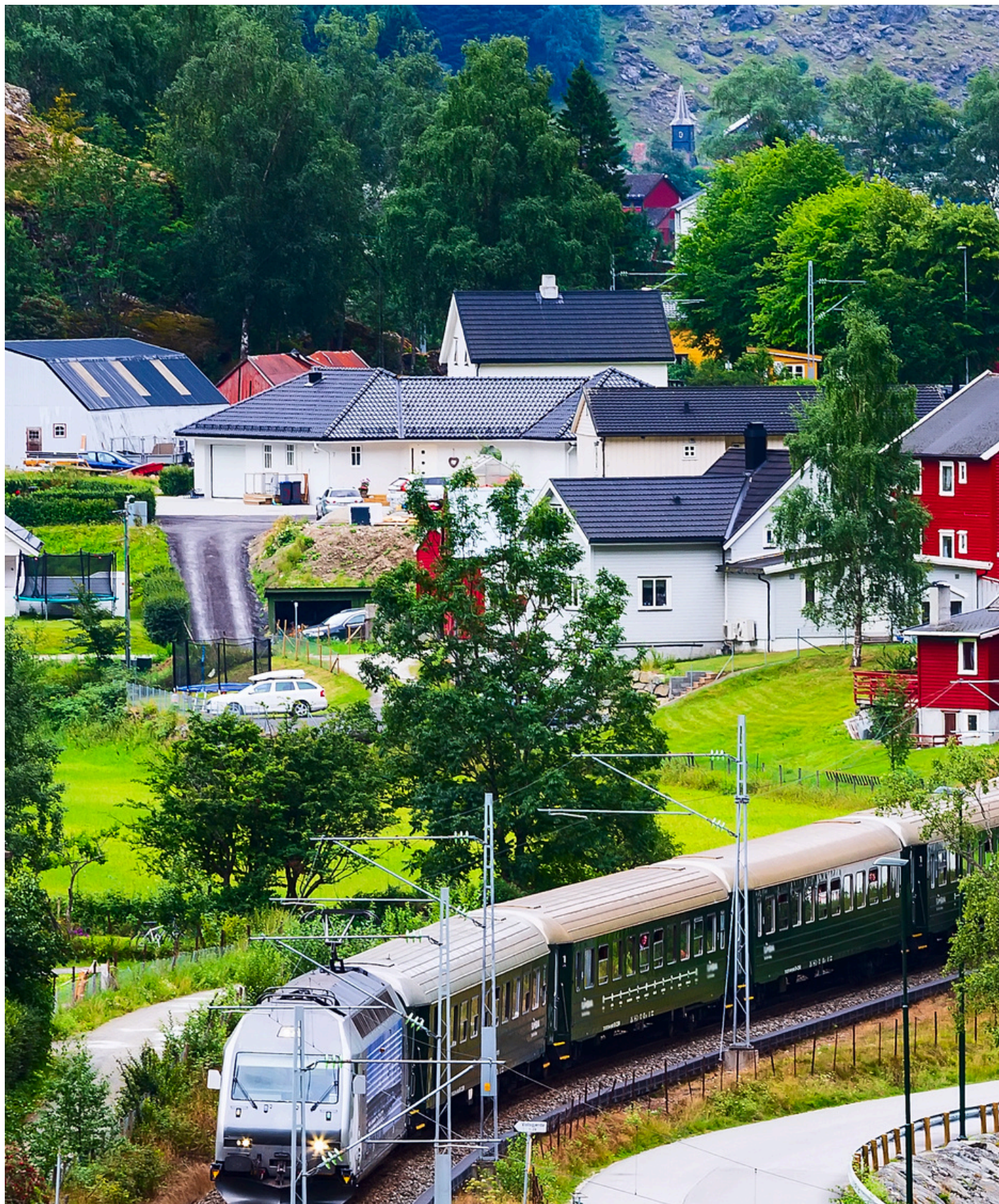
From Oslo to Bergen: A Journey Through Norway's Natural Wonders