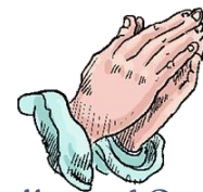
National Day of Prayer

Our gathering will conclude outdoors with root beer floats for all. Masks and social distancing will be observed. All are welcome!