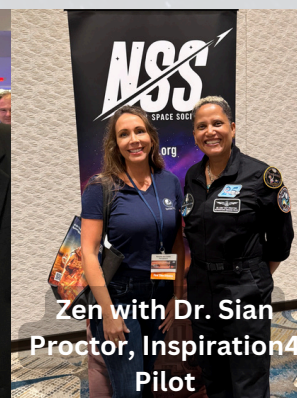
Zen with Dr. Sian Proctor, Inspiration4 Pilot