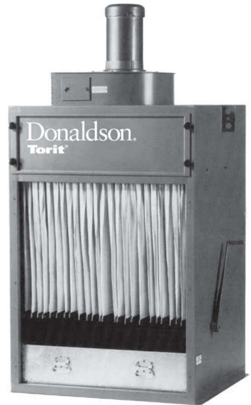
Cabinet 90 (door not shown)