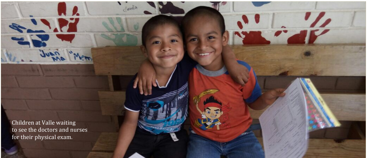
Children at Valle waiting to see the doctors and nurses for their physical exam.