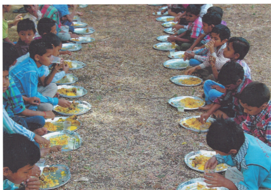
SCM helps feed children in India