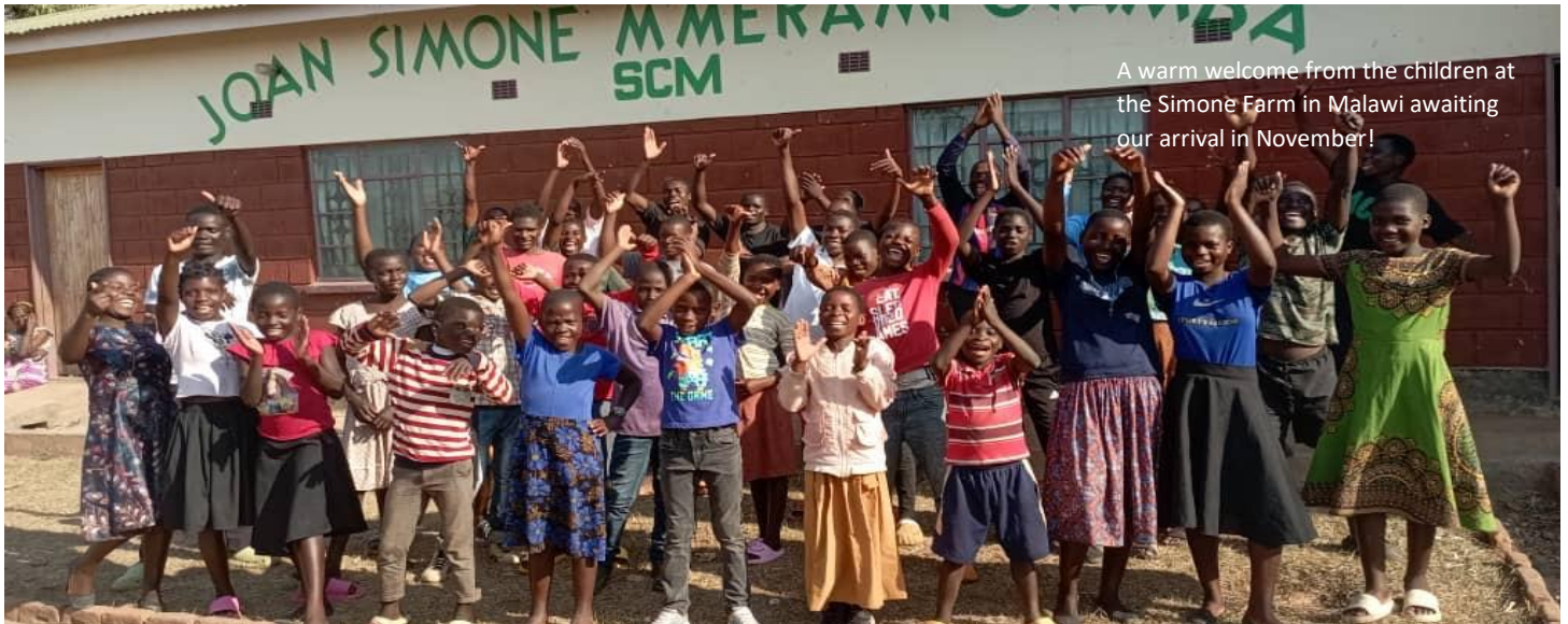
A warm welcome from the children at the Simone Farm in Malawi awaiting our arrival in November!

"It is not enough to love the young; they must know that they are loved."