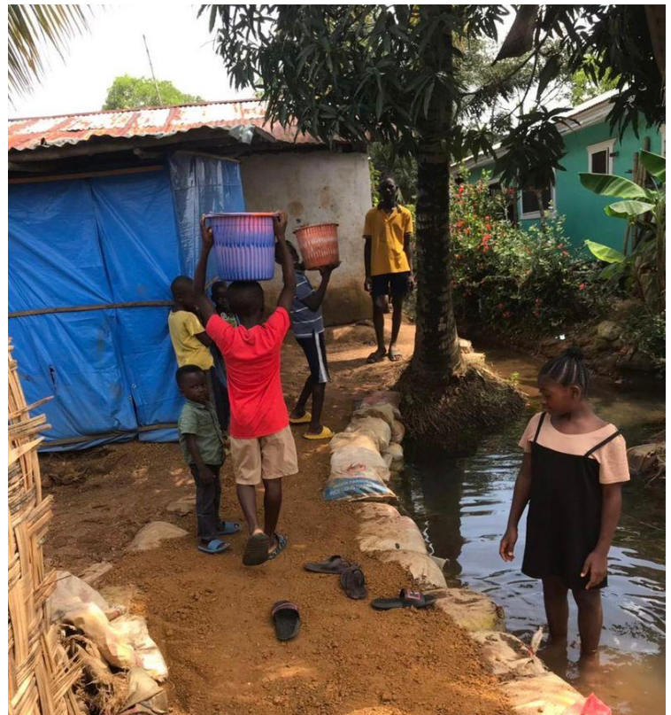
St. Joseph's 4 th water well for Liberia for the children of LUCRI school from the Christopolis community