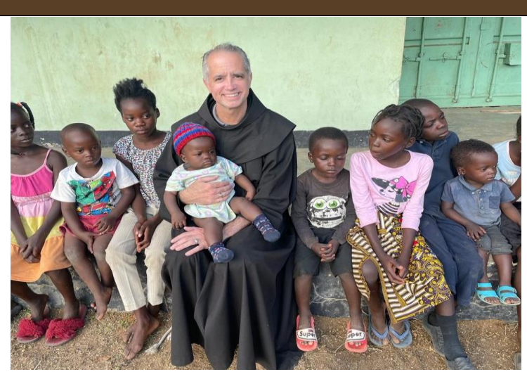
For No Special Reason, and Nothin' in Return

In our latest trip to Zambia, I was asked to celebrate a Mass for the children. Little did I know what a lasting impact this mass would have on me. As I processed in, I was pleasantly surprised to hear the most beautiful drums and amazing voices singing with such joy and faith. As I moved down the aisle, I immediately noticed a large number of wheelchairs, but it wasn't until I reverenced the altar and looked out into the congregation, that I realize the whole room was filled with all the severely malformed and handicapped children from the area. I was struck with their overwhelming enthusiastic and contagious joy, which was not only in their strong and vibrant voices, their rhythmic dancing but also shining through their beautiful faces and loving eyes. They were truly present and celebrating this liturgy with hope-filled expectation and a lively dynamic faith.