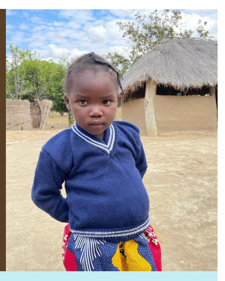
Photo: Kafololo Zambia, child wearing her new school sweater from SCM.