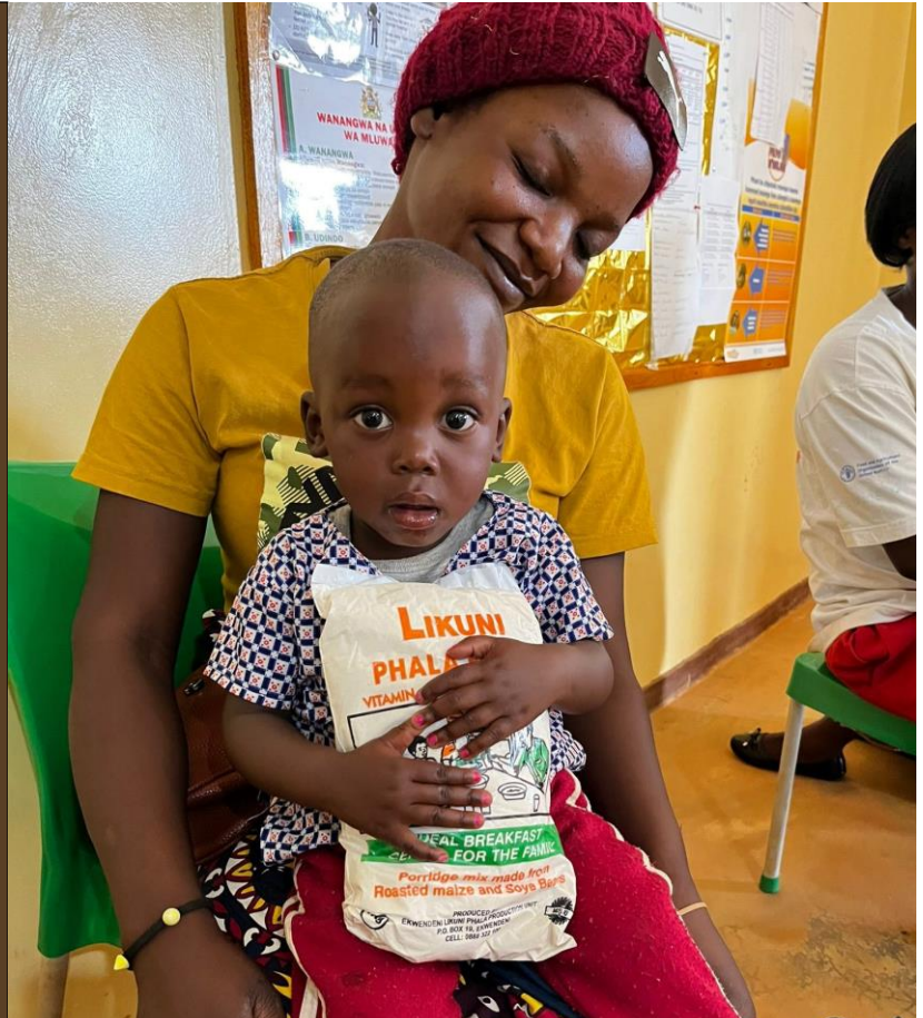
Photo: Child receiving food supplement donated by SCM at the clinic in Malawi run by the Poor Clare Sisters