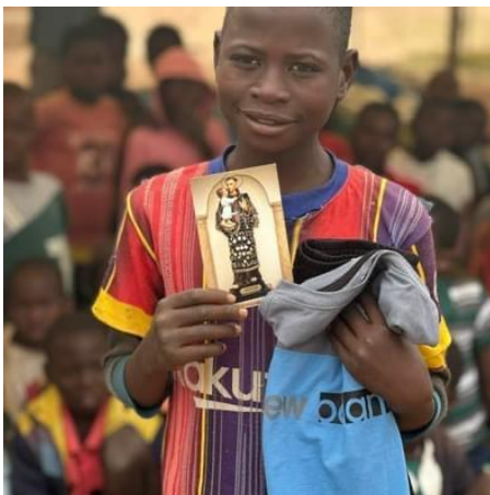
Photo far left: Boy at Simone Centre receives gift of a St. Anthony prayer card from St. Leonard's Church parishioner

It is so fulfilling to be able to experience the fruit of the seeds of love that we have been planting in Malawi and throughout the 14 countries that we minister to. Many of these girls were abandoned or thrown away, and one was even found in a latrine. This is exactly the purpose of Silent Children's mission, to be able to communicate God's unconditional love to the poorest of the poor. I have continually found that these souls who have been redeemed from their poverty, and their abject situations, are often the most grateful, and willing to give of themselves to others, precisely, because they themselves have experienced the hardships and difficulties of poverty, and now want to prevent others from doing so, and so, have a heart so disposed to seeking the good of the other.