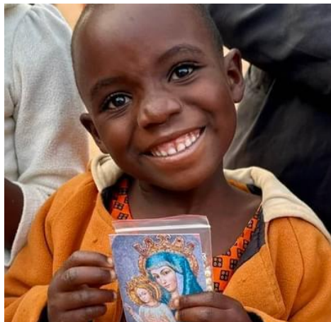
Photo left: Boy at Simone Centre receives gift of Our Lady prayer card from St. Leonard's Church parishioner