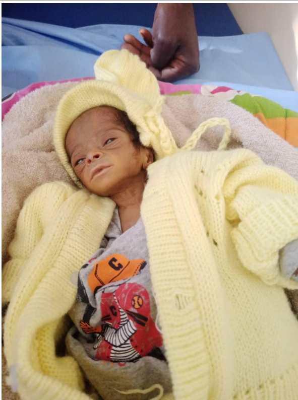
Photo left: Baby A six months after being helped at St. Thomas Hospital with assistance from Silent Children's Mission