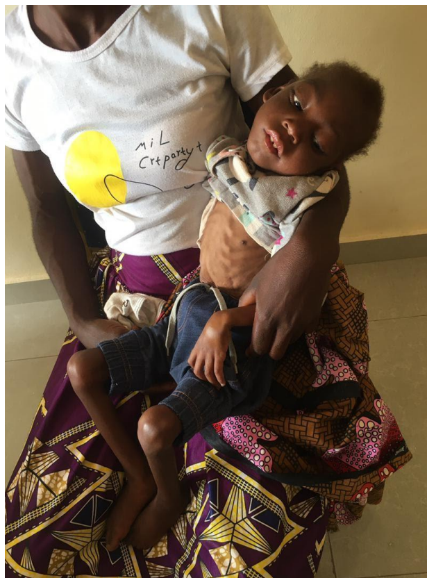
Photo left: Child A with developmental delays upon arrival at St. Thomas Hospital suffering from acute malnutrition

With the donation we were able to buy assorted medicines, food, school requirements, and transport costs for sick children to come for injections and cleaning of wounds. Thank you very much, may the almighty God continue to work through you to serve the children."