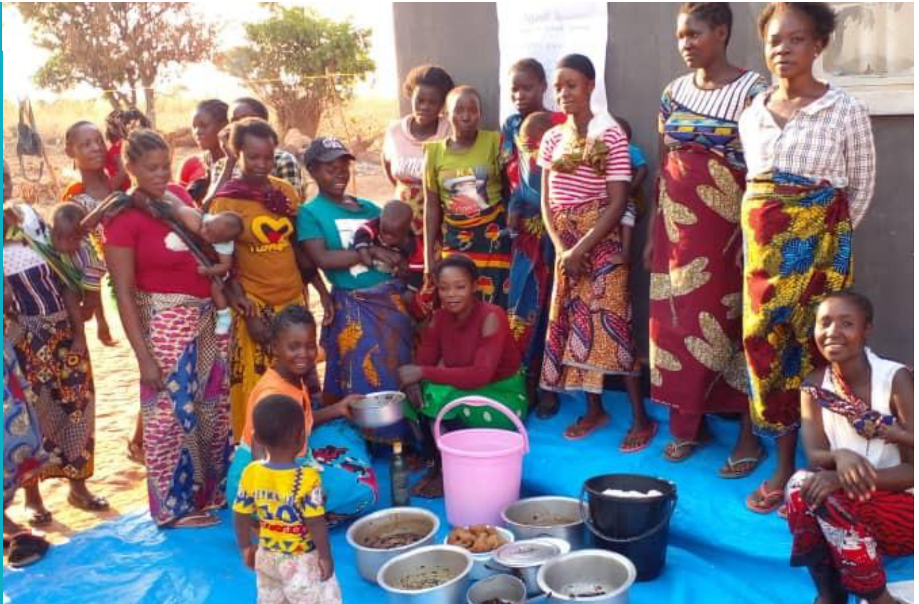
Photo right: After a class on healthy nutrition, participants share a meal together with the Franciscan Brothers of St. Joseph the Worker in Zambia