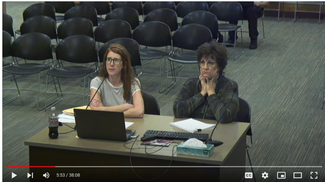
Brookings County Commission Meeting 11/10/2022

The county auditor shall keep the ballot boxes and pollbooks in the same condition as when received, until the meeting of the county canvassing board, when he shall deliver the pollbooks to such board. A violation of this section is a Class 6 felony.