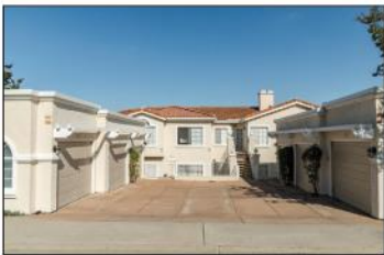
1664 Via Ocioco Lake San Marcos 3 bed/2 bath - 1,339 sq. ft. IN ESCROW Representing Seller