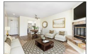
1616 Circa Del Lago #C108 Lake San Marcos 1 bed/1 bath - 660 sq. ft. SOLD - $128,300 Representing Seller