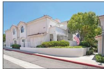
1874 Matin Circle San Marcos, CA 92069 2 bed/2 bath - 1,001 sq. ft. IN ESCROW Representing Buyer