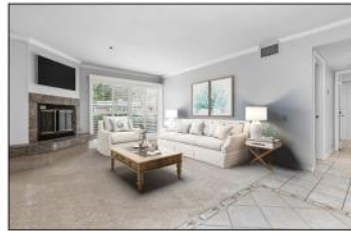
1682 Circa Del Lago #A110 Lake San Marcos 2 bed/2 bath - 962 sq. ft. FOR SALE - $268,300