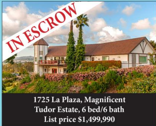
1725 La Plaza, Magnificent Tudor Estate, 6 bed/6 bath List price $1,499,990