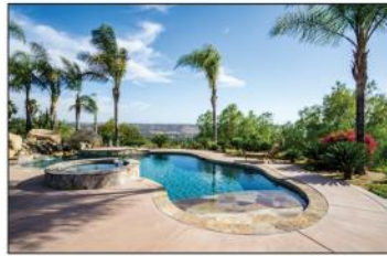
14486 Southern Hills Lane Poway, CA 92064 4 bed/5 bath - 5,298 sq. ft. FOR SALE - $2,298,000