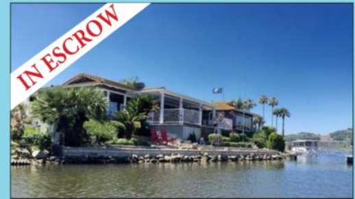
1472 La Habra Lakefront Twinhome. Panoramic Lake VIEWS. 2 bed/2 bath, List price $925,000-975,000