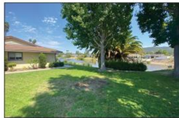
961 La Fiesta Way Lake San Marcos 2 bed/2 bath - 1,224 sq. ft. IN ESCROW Representing Seller