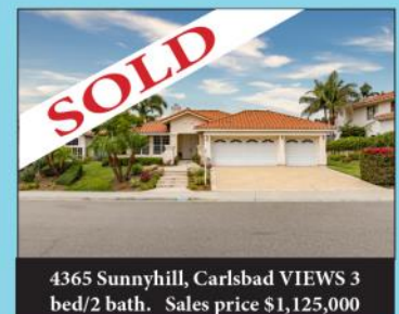
4365 Sunnyhill, Carlsbad VIEWS 3 bed/2 bath. Sales price $1,125,000