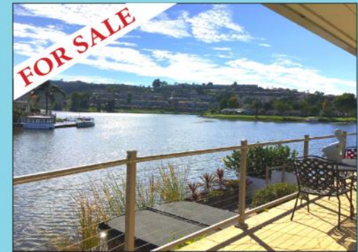
1493 La Linda 3 bed/ 2.5 bath. Stunning Lakefront property List price $1,350,000