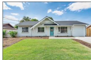
266 Gannet Drive Vista, CA 92083 2 bed/2 bath - 1,247 sq. ft. SOLD - $520,000 Represented Buyer