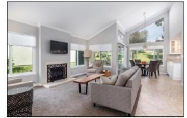
1645 La Verde Lake San Marcos 3 bed/3 bath - 1,595 sq. ft. IN ESCROW Representing Seller