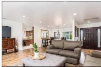
1263 San Pablo Drive Lake San Marcos 3 bed/2 bath - 1,897 sq. ft. IN ESCROW Representing Seller