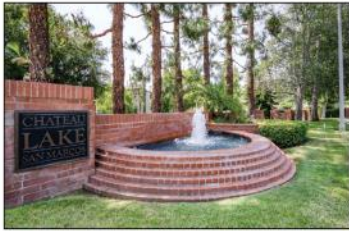
1616 Circa Del Lago A111 Lake San Marcos 2 bed /2 bath - 1,030 sq. ft. FOR SALE - $299,000