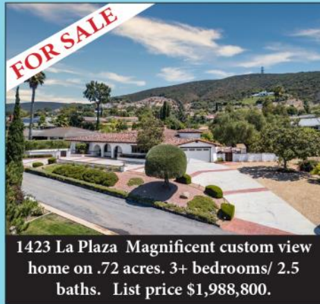
1423 La Plaza Magnificent custom view home on .72 acres. 3+ bedrooms/ 2.5 baths. List price $1,988,800.