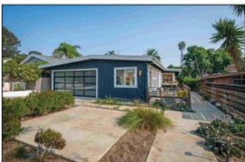
405 9th Street Del Mar, CA 92014 3 bed/2 bath - 1,800 sq. ft. SOLD - $2,375,000 Represented Buyer