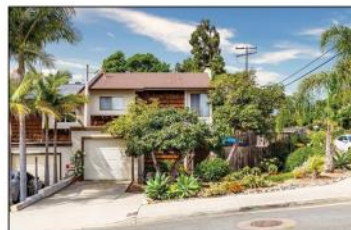
250 Calle De Sereno Encinitas, CA 92024 3 bed/2.5 bath - 1,351 sq. ft. SOLD - $960,000 Represented Seller