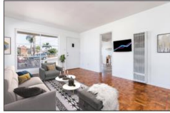
6045 Thorn Street San Diego, CA 92115 3 bed + office/1 bath - 1,682 sq. ft. FOR SALE - $529,000