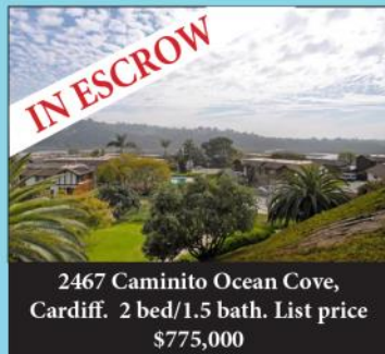
2467 Caminito Ocean Cove, Cardiff. 2 bed/1.5 bath. List price $775,000