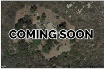
2969 Solar Lane San Marcos, CA 92069 4 bed/2 bath - 1,700 sq. ft. 24 Acres COMING SOON