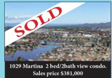
1029 Martina 2 bed/2bath view condo. Sales price $381,000

“Manufactured/Mobile Homes” • SOLD 2130 Sunset #93 Sales price $150,000 • FOR SALE 650 Rancho Santa Fe #178, 2 bed/2 bath, List price $204,900