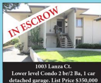
1003 Lanza Ct. Lower level Condo 2 br/2 Ba, 1 car detached garage. List Price $350,000