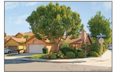
731 Avenida Abeja San Marcos, CA 92069 3 bed/2 bath - 1,617 sq. ft. IN ESCROW Representing Buyer