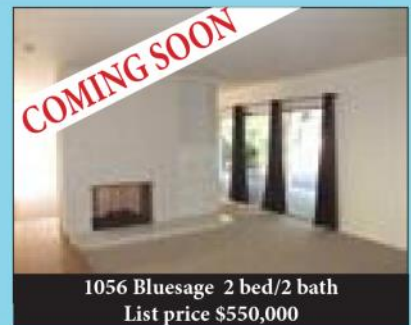
1056 Bluesage 2 bed/2 bath List price $550,000