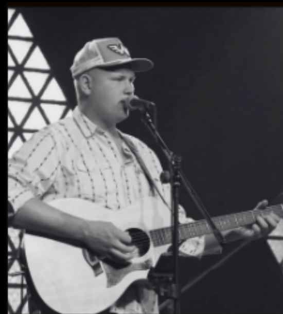
Bottles and Bibles Tyler Childers (Cover)