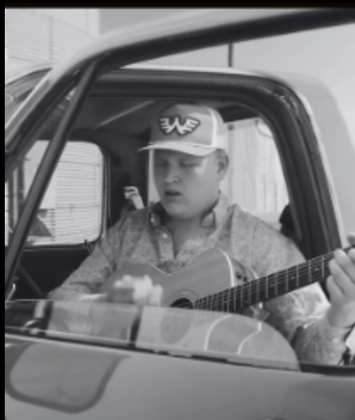
Revival by Zach Bryan (Cover)