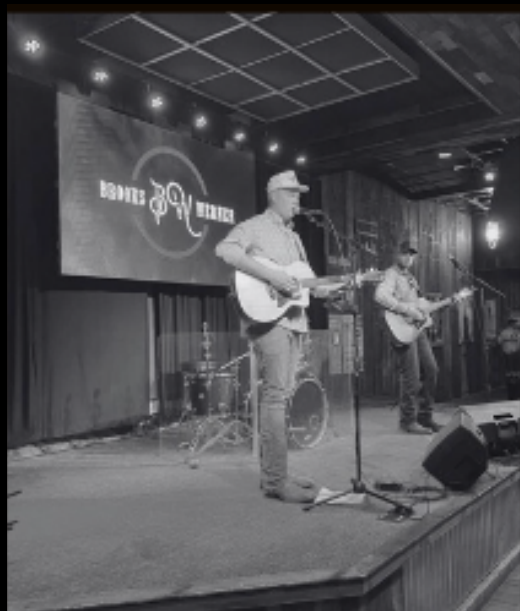
Rock Salt & Nails - Tyler Childers (Cover)