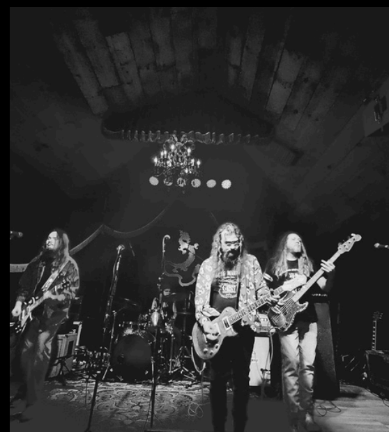
Marquee Backstage (Official Music Video)