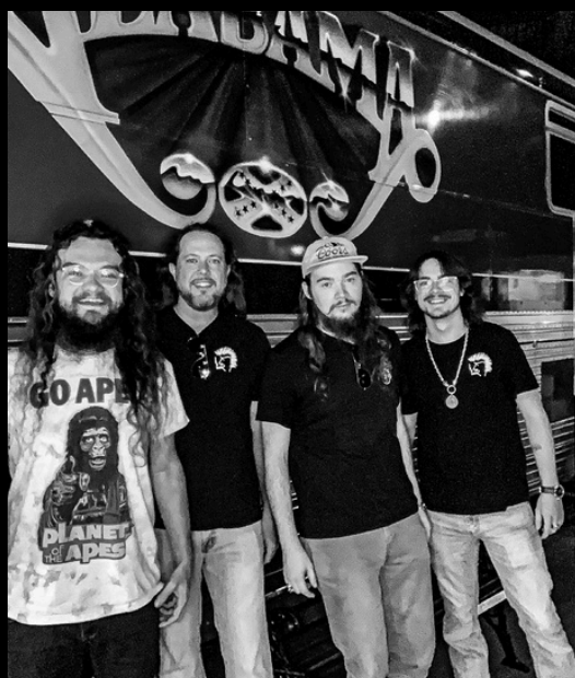
There's A Break In The Wall (Official Music Video)