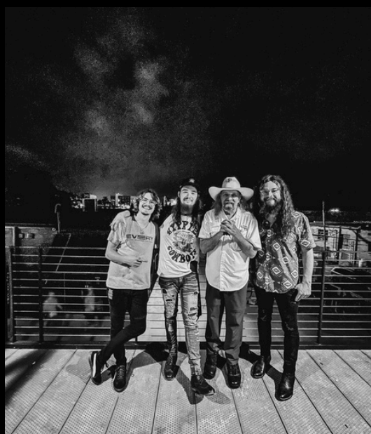
Last Fool In The Line (Official Music Video)