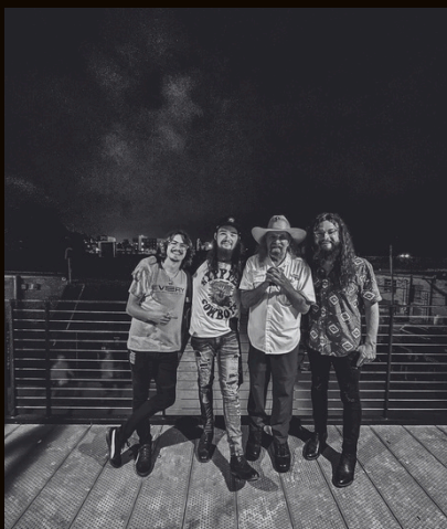
Last Fool In The Line (Official Music Video)