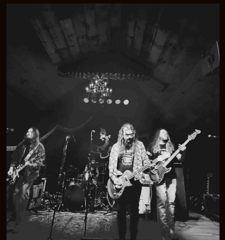
Marquee Backstage (Official Music Video)