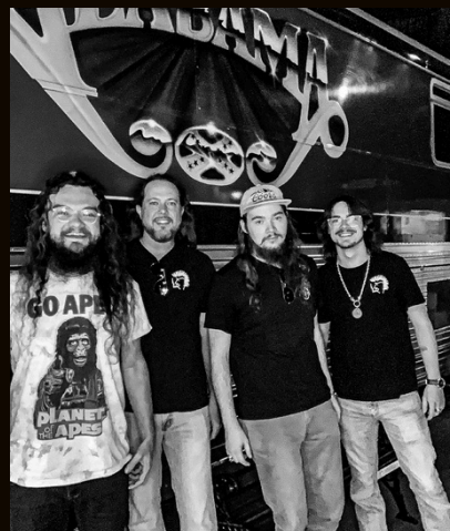
There's A Break In The Wall (Official Music Video)