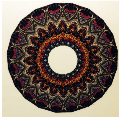
These are Paula Nadelstern fabrics