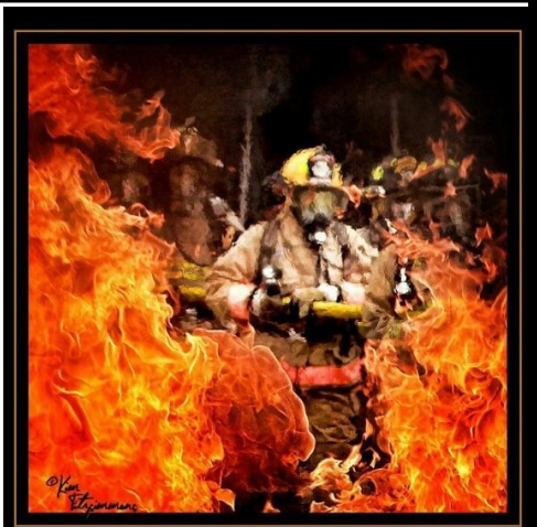
IT'S NOT WHAT WE DO... IT'S WHAT WE'RE WILLING TO DO