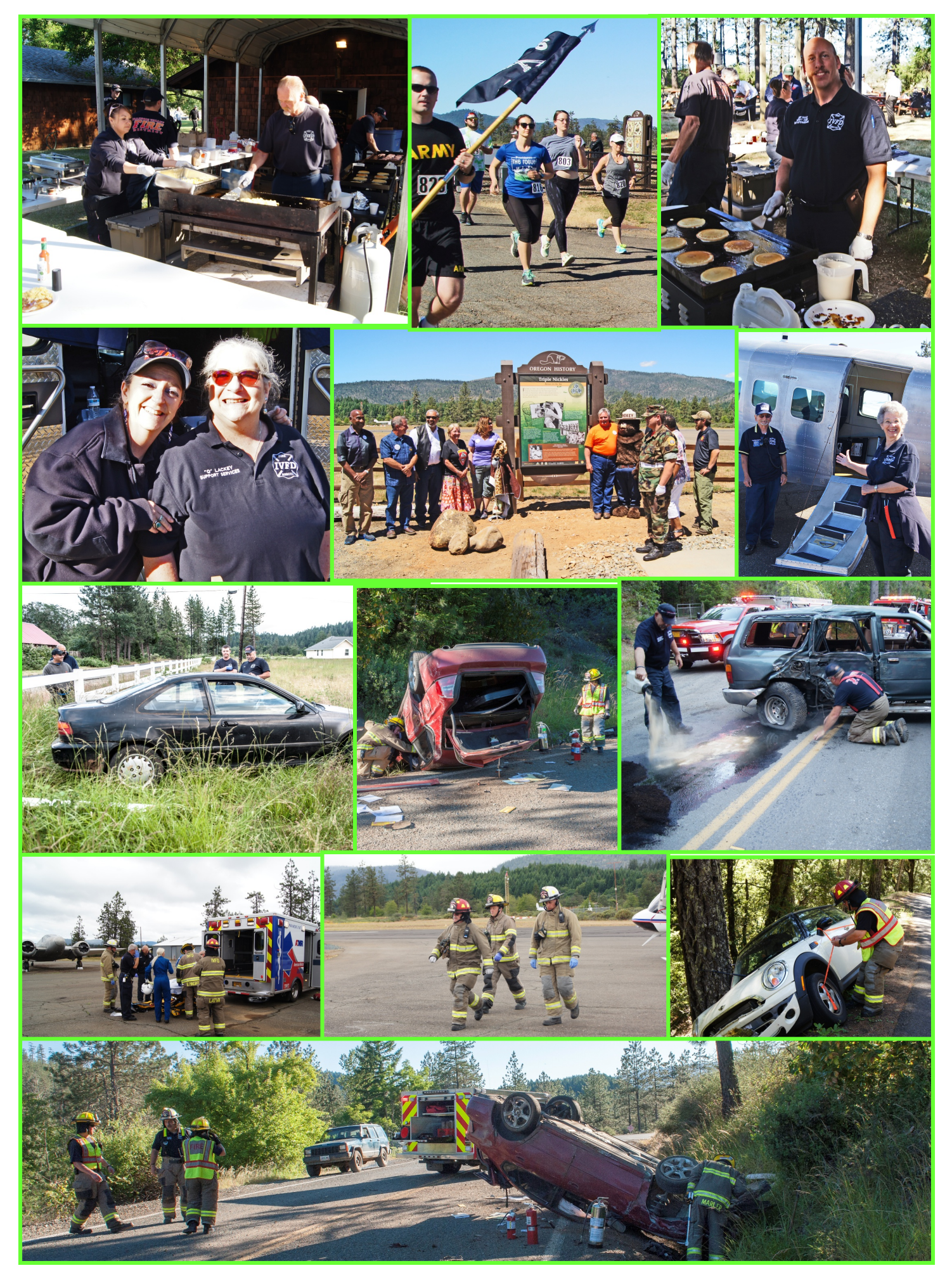
ILLINOIS VALLEY FIRE DISTRICT SMOKE SIGNALS, JULY 2017