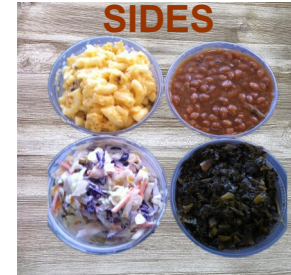
Plate Meat & 2 Sides

Pulled Pork 18.99 Beef Brisket 18.99 Ribs 19.99