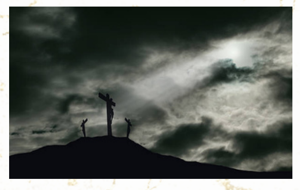
It was the darkest day in history.