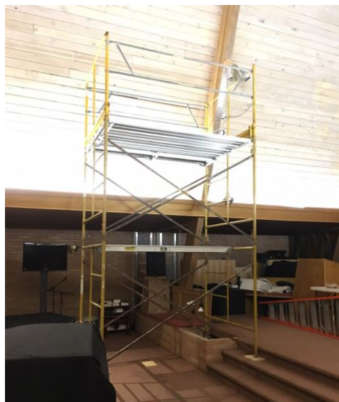
Scaffolding used to install new speakers