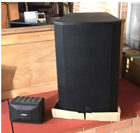
Old Sanctuary speaker versus new Sanctuary speaker