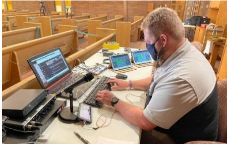
May 15 th Salem's Work Day!