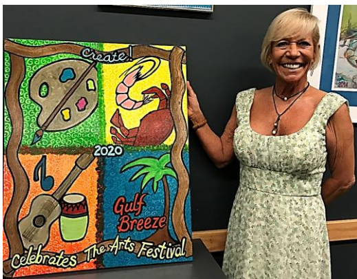
2020 Gulf Breeze Arts Festival official poster