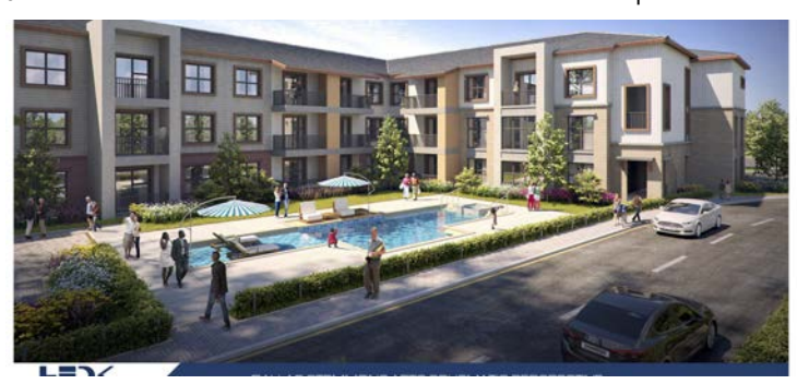
Palladium USA's new rental community on Stemmons Freeway in Dallas will have almost 90 units.