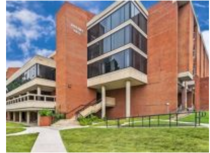
DHCD Provides Construction Financing for 54-Unit Affordable Seniors Housing Project in D.C. April 13, 2021