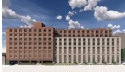
Olshan Properties, O'Connor Capital Partners Break Ground on 221-Unit Parkchester Gardens in the Bronx April 15, 2021