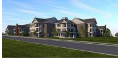
Grace Inspired Ministries Plans for Sellersville Affordable Senior Apartments in Telford, Pennsylvania April 22, 2021