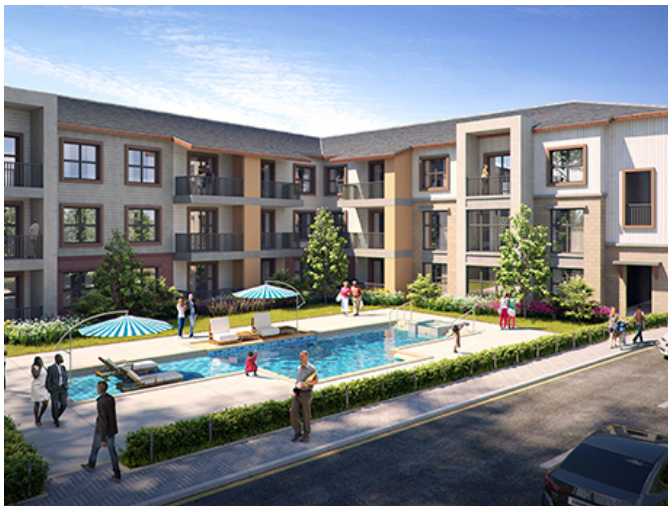
Palladium expects to deliver the first units at its new mixed-use community at 2440 Southwell Road in Dallas in June 2022.